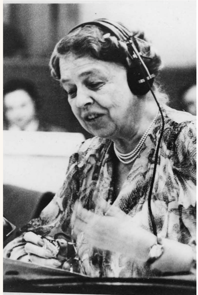
Eleanor Roosevelt at the United Nations

Free of Cost - Donations Welcome! All Concert Proceeds to support Women Services in the Sedona area