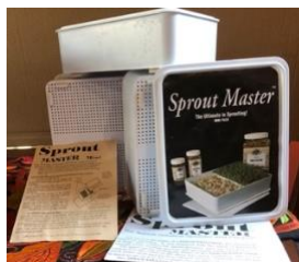
3 Sprouting Containers

In this column you can 1) Trade items, like jigsaw puzzles, books, tools... 2) Sell items with all money going to SUUF . You name the price. 3) Give Away items in really good condition. Be sure to provide a good description of each item.